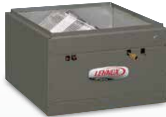
Humiditrol® Dehumidification System